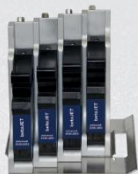
verso 4 head