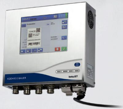
betaJET verso Thermal Inkjet (TIJ)